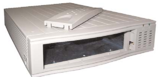
Universal 3.5" - 5.25" Case

The FIREVue™ IEEE 1394B FireWire CASE is designed to support a variety of Hard Drives, MO, Removable, Tape, CD-ROM, DVD, and other drive mechanisms. The Ultra ATA133 speed makes these cases the fastest in the market. We offer the best price/performance drive sub-systems available.