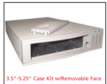
3.5"-5.25" Case Kit w/Removable Face