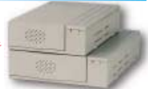
Horizontal Case Kits for 3.5" & 5.25" Drives, both models come with three bezels for tape, floppy, dat, or hard drive installation.