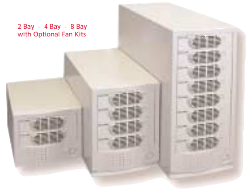
2 Bay - 4 Bay - 8 Bay with Optional Fan Kits