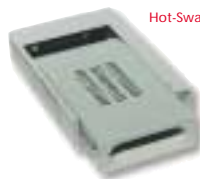
Hot-Swap Removable Bay Kit

*TPO is designed for LVD Ultra 2 SCSI. When ordering simply add the letters "TPO" to the part number. Part number 1004 above would be 1004-TPO.