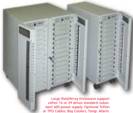
Large Raid/Array Enclosures support either 14 or 29 drives standard redundant 600 power supply. Optional Teflon or TPO Cables, Bay Coolers, Temp. Alarm.