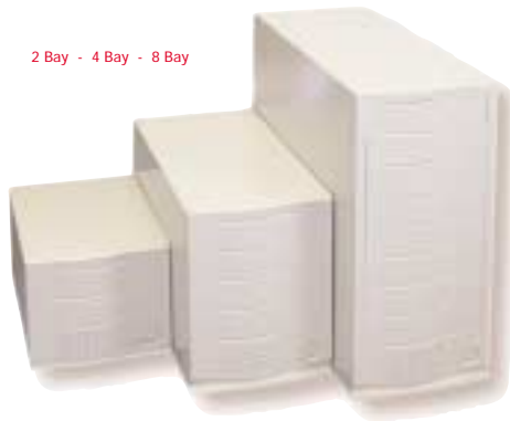
2 Bay - 4 Bay - 8 Bay

Granite Raid / Array ULTRA Cases are built to go fast. Our design offers higher performance and superior cooling. Granite Drive-Systems run up to 15 Ultra SCSI drives!