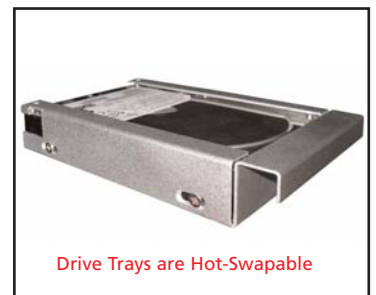
Drive Trays are Hot-Swapable