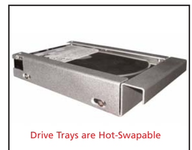
Drive Trays are Hot-Swapable