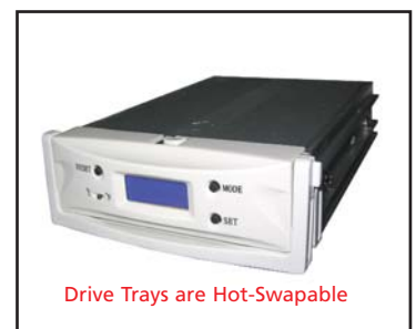
Drive Trays are Hot-Swapable