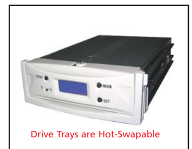
Drive Trays are Hot-Swapable